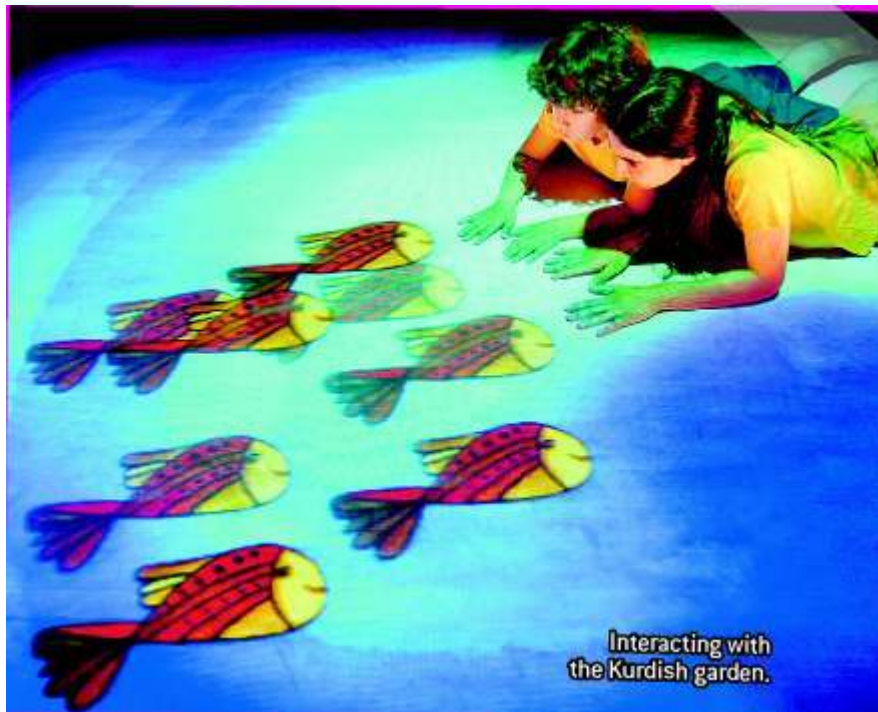
Interacting with the Kurdish garden.

Japanese Garden: Tues, 4pm; Wed, 6pm; Fri, 4pm; Sat, 6pm. Season continues Feb 20-23. Italian garden: Today, noon; Tues, 6pm; Thur, 4pm; Fri, 6pm; next Sun, noon. Season continues Feb 21-24. Kurdish garden: Today, 2pm; Wed, 4pm; Thur, 6pm; Sat, noon; next Sun, 2pm. Season continues Feb 20-24. Bradley Studio, UWA, Nedlands. Tickets $20 from BOCS.